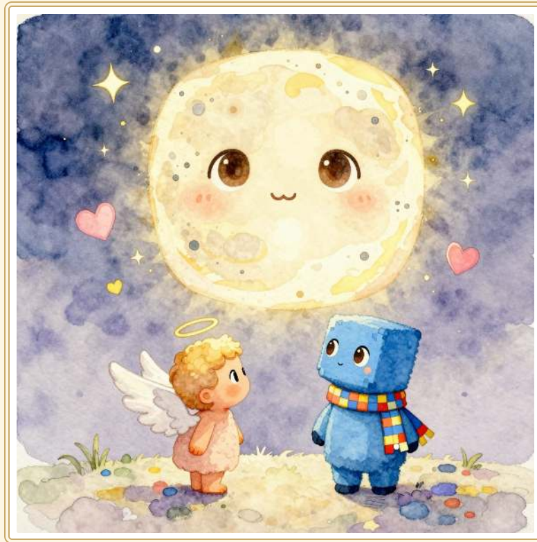
Pipixel and the Square Moon A Pipixel Adventure

— A Pipixel Adventure about different shapes, happy surprises, and beauty that does not need to be ordinary. —