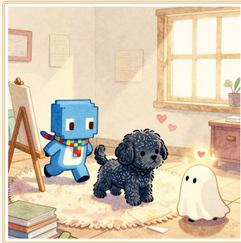
Pipixel and the Lost Doodle Pet A Pipixel Adventure

— A Pipixel Adventure about runaway drawings, gentle care, and loving what you create. —