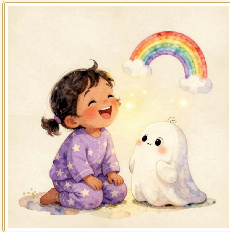
Luluma and the Loud Happy Problem Quiet Joy, Big Magic

— When a little girl gets so excited her happy shouts turn into bouncy rainbows, a gentle ghost shares a quiet secret. —