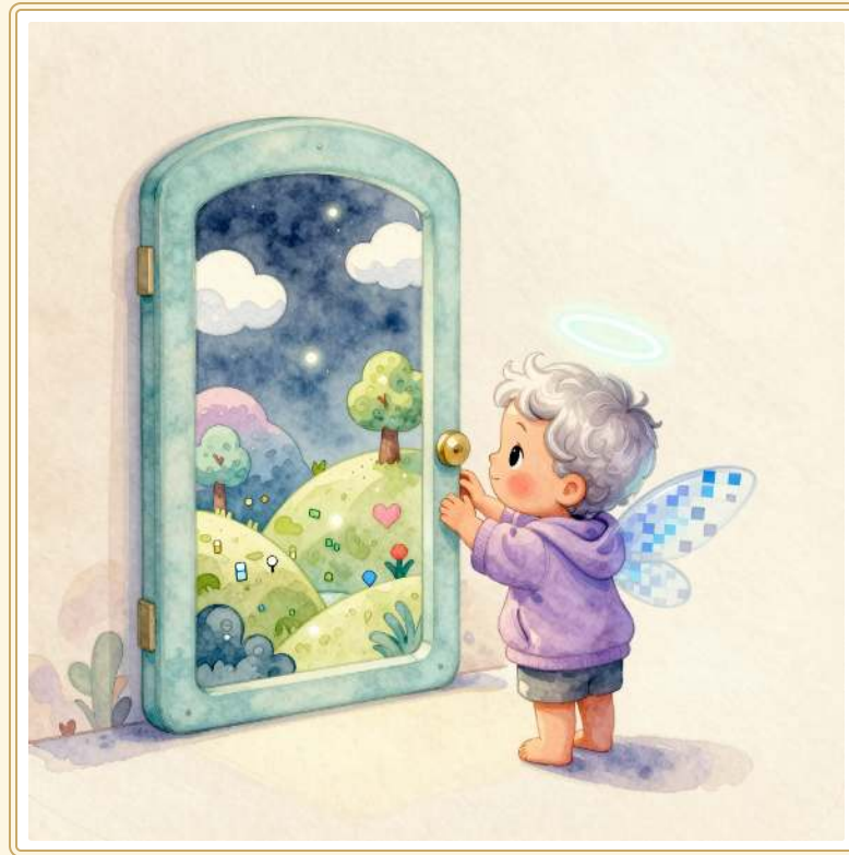
Glitchub and the Secret Screen Door A Chibub Adventure

— A Chibub Adventure with glowing doors, sleepy pixels, and a world that needs quiet time.