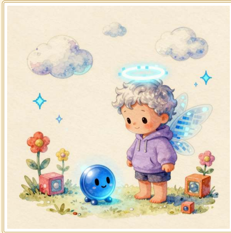
Glitchub and the Blue Button A Chibub Adventure

— A Chibub Adventure with square clouds, soft rebuilds, and one very tempting button. —