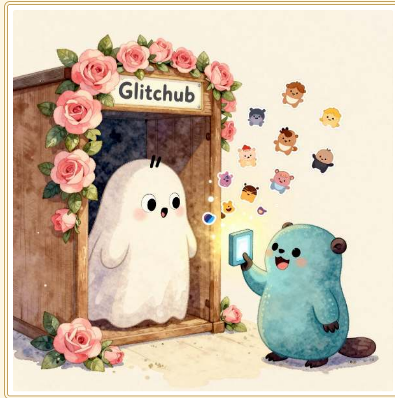
Appy and the Wedding Photo Booth Glitch A Soft Weirds Desi Boom Adventure

— When a high-tech photo booth starts printing floating stickers of everyone, a shy little ghost discovers her own special place in the picture. —